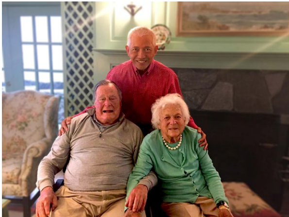
Walker's Point, Summer 2017.

"...you will never regret not having passed one more test, not winning one more verdict or not closing one more deal. You will regret time not spent with a husband, a friend, a child or a parent."