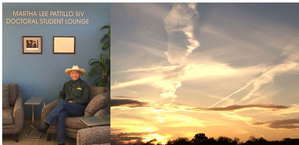
The University of Texas iSchool, Austin, April 22, 2018. The day after the celebration of BPB's life.

Blessed be the day you were born; Blessed be the day we met; Blessed be the days we are together; In person or in spirit; Yesterday, today, tomorrow, forever!