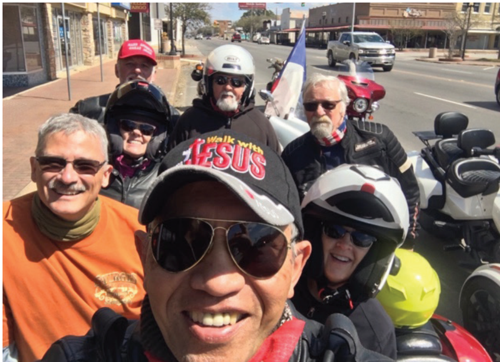
The Seven "History Riders" in Bay City