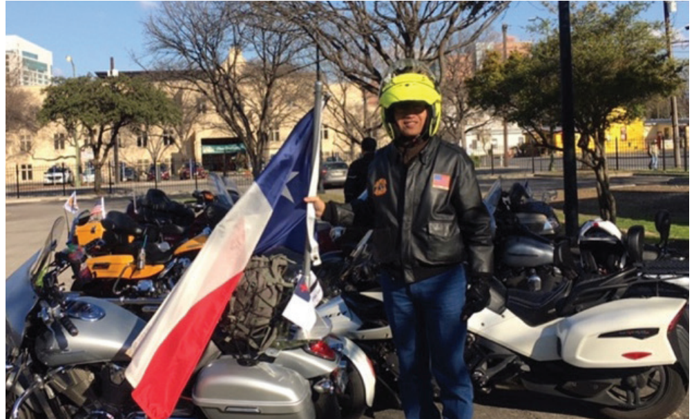
First Presbyterian Church San Antonio near The Alamo